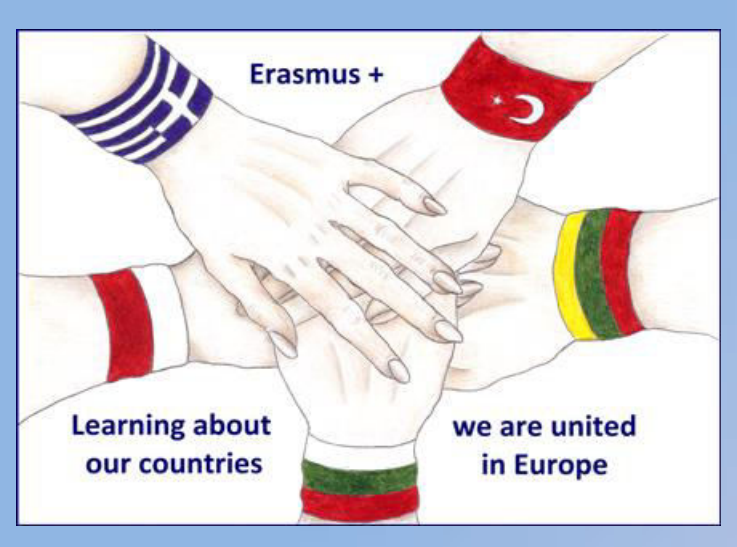
Meeting in Rhodes 2-8/10/2016